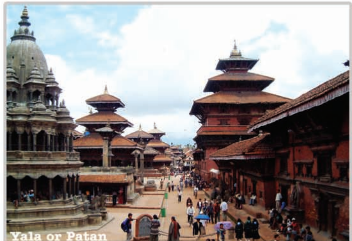
Yala or Patan

Patan as it is known today is located on the southern banks of the Bagmati River and is one of the three main cities in Kathmandu Valley. The city is believed to be the first settlement in the Valley and was established by the Kirat dynasty who ruled for more than 1200 years from the 3rd century BC. Patan is famous for its amazing collection of fantastically carved temples, palace courtyards, water spouts, public baths and houses with their equally elaborate wood, stone and metal carvings under the patronages of the Kirat, Lichivi and Malla kings. Patan has more than a 1000 temples and monuments dedicated to the uniquely Nepali mix of Buddhist and Hindu gods, chief among which are the mounds erected by the great Indian Emperor Asoka in the four corners of the city when he visited Nepal in 250 BC. Patan Durbar square is one of the seven Monument Zones that make up the Kathmandu Valley UNESCO World Heritage Site.