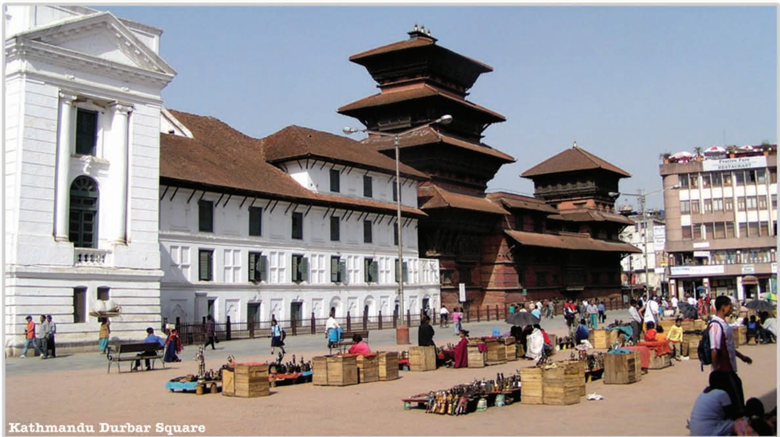
Kathmandu Durbar Square