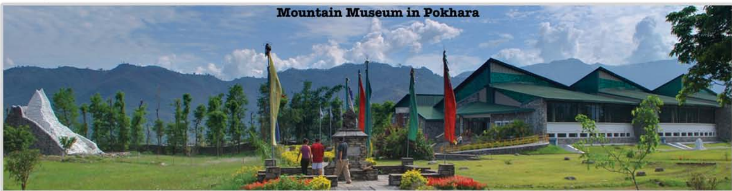
Mountain Museum in Pokhara

Gurkha Memorial Museum: Open to the general public in July 2005, the Gurkha Memorial is one of Pokhara's newest museums. A brainchild of and operated by the Gurkha Memorial Trust, the museum is a noble undertaking to conserve and promote the gallant history of the famous Gurkhas. The museum exhibits in display are categorized into a Historical gallery; Gurkha infantry regiment gallery, Gorkhas gallery, and Gurkha specialist/corps unit gallery. There is also a theater room and a library specializing in a rich archive of documentaries, books, and publications relevant to the history of Gurkhas.