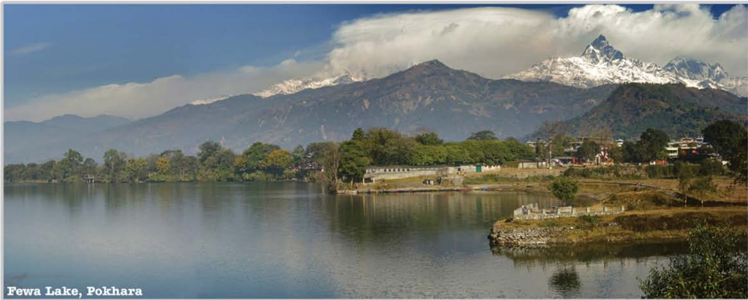
Fewa Lake, Pokhara