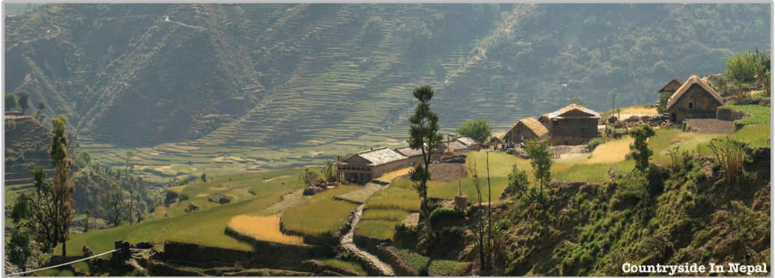
Countryside In Nepal